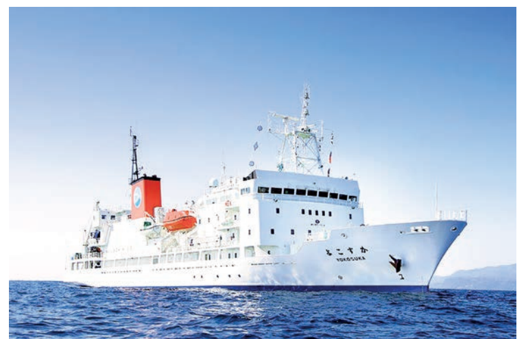
The Japan Agency for Marine-Earth Science and Technology had planned to survey waters off Tohoku, an area hit by the March 2011 earthquake and tsunami, as well as the Nankai Trough, where a megaquake is feared, among other areas.

The two vessels -- the support ship Yokosuka, which carries a submersible for deep-sea research, and the Shinsei Maru, capable of surveying seafloor and ocean conditions -- were scheduled for deployment.