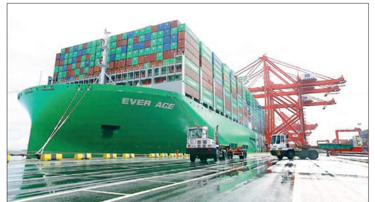
Photo taken on 6 October 2021 shows the world's largest container vessel "Ever Ace" at the Colombo Port in the Sri Lankan capital.

SRI Lanka will begin releasing containers from the Port of Colombo to three external container inspection yards through an online system from 3 April a senior Customs officer said on Tuesday.