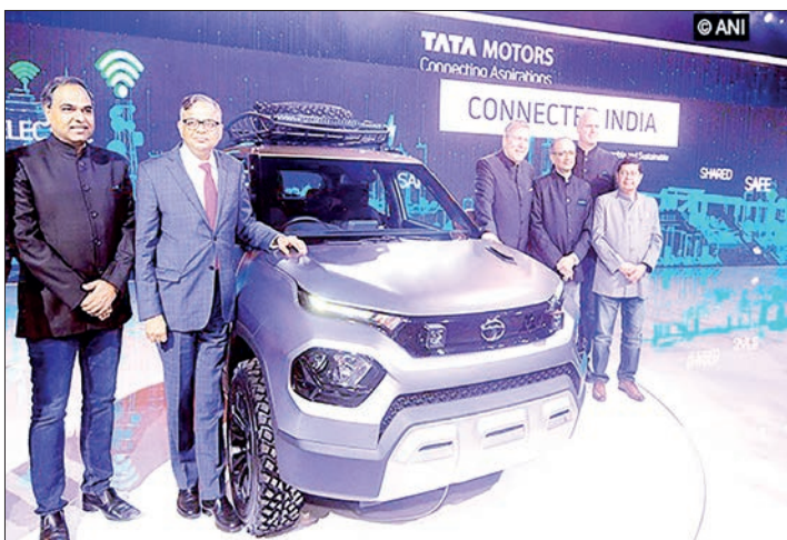
The report estimated total volume growth to be 22 per cent for Tata Motors PV to 63,800 units.

The report estimated total volume growth to be 22 per cent for Tata Motors PV to 63,800 units and 18 per cent for Mahindra & Mahindra Auto to 99,000 units. Maruti Suzuki is expected to expand by 11 per cent to 215,000 units, while Hyundai may see a marginal 1 per cent increase to 68,000 units. — ANI