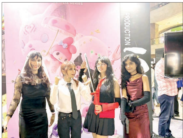
File photo shows an anime-related event being held in India in September 2025.

VIDA, backed by voice actor agencies, wants to use this technology to let Japanese anime retain its native voices abroad, helping fan bases grow. Meanwhile, Itochu Corp. and the Japan Actors Union created the J Vox Pro voice database, designed to store and license performers' voices securely, including AI generated derivatives, so actors can earn when their voices are used. Today voice itself is not protected by Japanese copyright, so AI can mimic actors without breaking the law, and many voice talent earn less than three million yen a year. Legal experts say private certification helps, but Japan will ultimately need stronger laws and tougher enforcement to stop unlawful voice cloning. — Kyodo