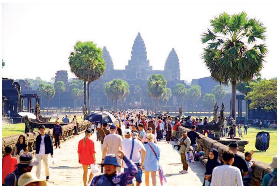
Tourists visit the Angkor Wat Temple at the UNESCO-listed Angkor Archaeological Park in Siem Reap province, Cambodia, 29 January 2025.

Located in northwest Siem Reap province, the 401-square-kilometres Angkor Archaeological Park, the kingdom's most popular tourist destination, is home to 91 ancient