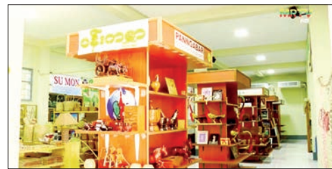
The Myanmar Handicraft Centre showcases various handicraft items.

THE Small Scale Industries Department of the Ministry of Cooperatives and Rural Development will grant permits to rent shops at the Myanmar Handicrafts Centre and use a cash memo for the 2026-2027 financial year.