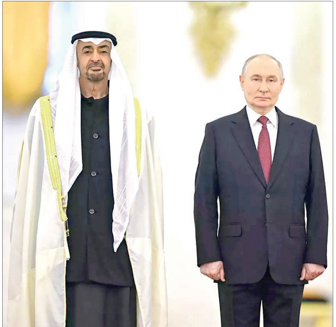
UAE President Sheikh Mohamed bin Zayed Al Nahyan and Russian President Vladimir Putin attend a welcoming ceremony before a meeting at the Kremlin in Moscow, Russia on 29 January 2026.

The leaders also emphasized the importance of early cessation of hostilities in the Middle East, the statement said, adding that the presidents noted a high level of cooperation and contacts between states that successfully develop. — SPUTNIK