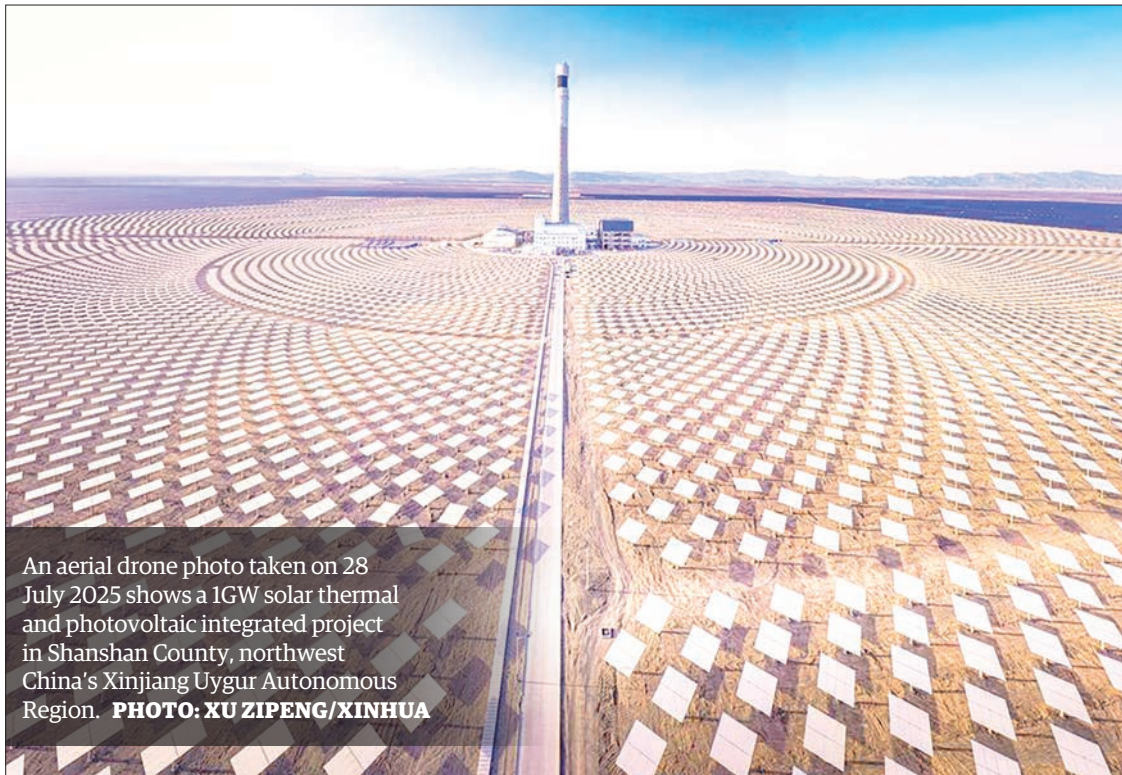
An aerial drone photo taken on 28 July 2025 shows a 1GW solar thermal and photovoltaic integrated project in Shanshan County, northwest China's Xinjiang Uygur Autonomous Region.

The sales revenue of integrated circuit design and manufacturing also saw a sharp increase.