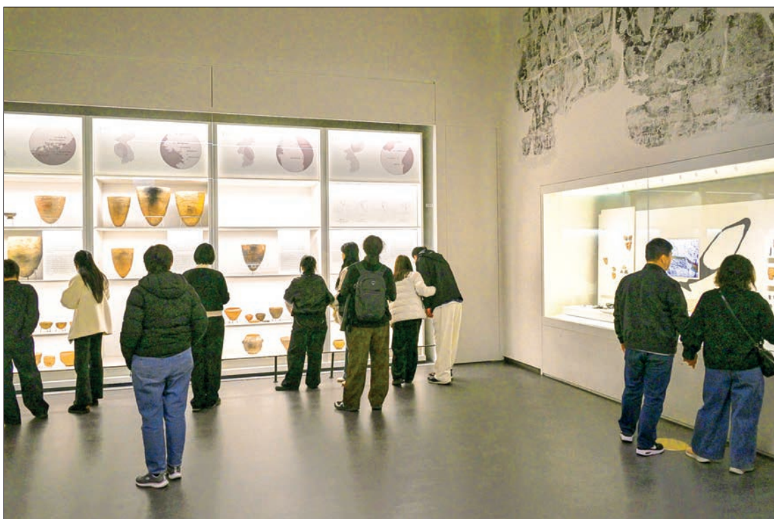
Visitors see an exhibition at the National Museum of Korea in Seoul on 9 March 2026.

The museum's modern approach to tradition is evident in the "Room of Quiet Contemplation".