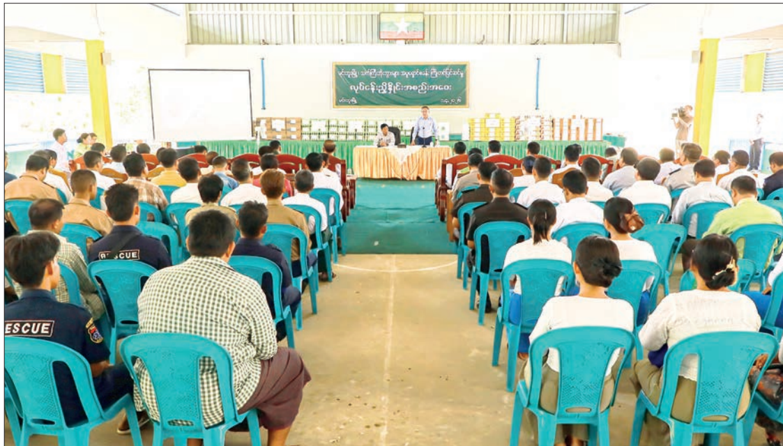
Union Ministers U Khin Maung Yi and Dr Soe Win join discussions to open heat relief shelters in Minbu Township, Magway Region.

During the meeting, the officials of the Minbu Township heat relief shelters opening supervisory committee reported on the establishment of centres at Pyinnya Alinn Young Private School and Sasana Beikman (downstairs), and Union ministers coordinated the discussion and made proper instructions.