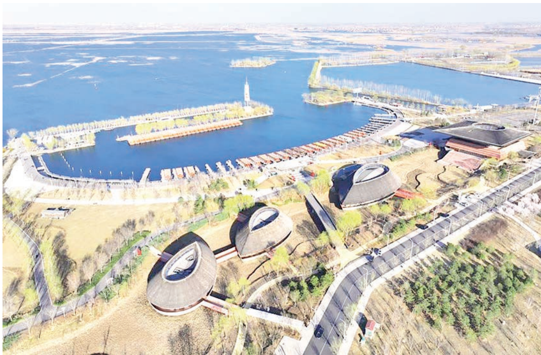
An aerial drone photo taken on 18 March 2026 shows the Baiyangdian Lake in Xiong'an New Area, north China's Hebei Province.

Meteorological data will be transmitted in real time to a cloud-based big data platform.