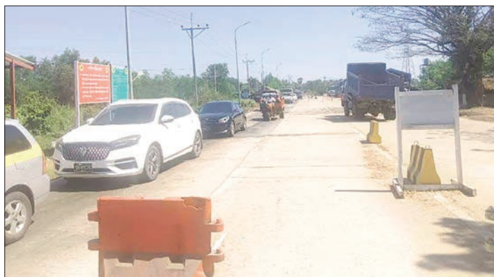
An EV vehicle is seen on the road.

This measure follows the expiry of the exemption period for road usage fees granted to electric vehicles and their related equipment, which ended on 31 March. Consequently, the Ministry of Construction, through its Department of Highways and Department of Bridges, will begin collecting usage fees from EVs travelling on major roads and bridges