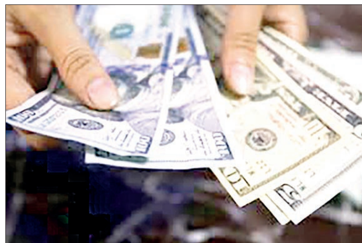
Greenbacks are seen at the money changer counter.

THE Central Bank of Myanmar (CBM) made over 4.1 million baht transactions in the forex market on 31 March. CBM injected US$2 million into fuel oil-importing companies on that day, after selling $2.3 million to fuel oil-importing companies on 30 March, in addition to the injection of over one million baht in the foreign exchange market.