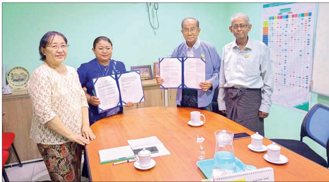
Officials from the Myanmar Fruit, Flower and Vegetable Producer and Exporter Association (MFVP) and MyanSeed Agribusiness Consultancy Co Ltd show their MoU documents at the signing event on 30 March 2026.

This MoU aims to cooperate in research activities for agricultural development, organizing training, seminars, and technical talks, exchanging research findings and implementing advanced farming methods. — NN/KK