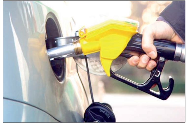
A vehicle is seen being refuelled at a petrol station.

Authorities have stated that effective action will be taken against any stations found to be repeatedly violating the prescribed regulations. — ASH/KZL