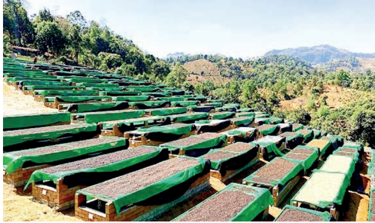
This image shows farming in the Shan hills that is drawing FDIs.