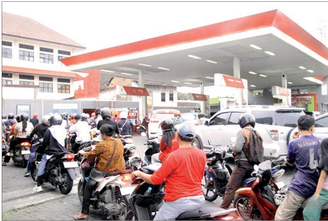
Vehicles wait in line to refuel at a gas station in Surakarta, Central Java, Indonesia, 31 March 2026. Indonesia is pushing a series of energy-saving measures to reduce fuel consumption and strengthen fiscal resilience amid rising global uncertainty triggered by the ongoing Middle East conflict, Coordinating Minister for Economic Affairs Airlangga Hartarto said on Tuesday.

The Israel Defence Forces (IDF) on Wednesday said it struck a factory that transferred chemical substances to an Iranian facility designated for developing chemical weapons.