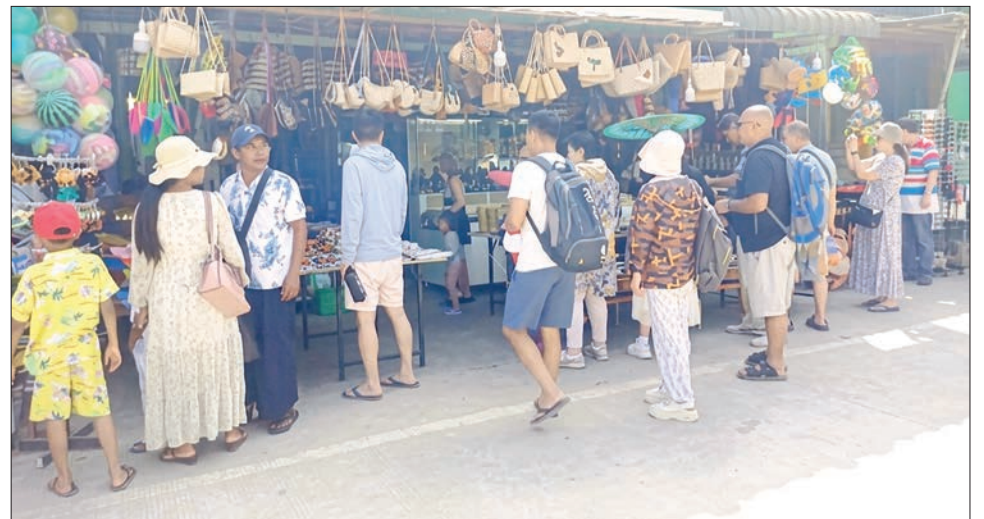
These images portray holidaymakers enjoying their time at the Ngwehsaung Beach during the first quarter in 2026.

According to the Directorate of Hotels and Tourism, a total of 112,936 domestic and international visitors travelled to the Ngwehsaung Beach, one of Myanmar's most well-known seaside resorts, in the first three months of 2026. The number of visitors reached 32,294 in January, 37,403 in February, and 43,239 in March.