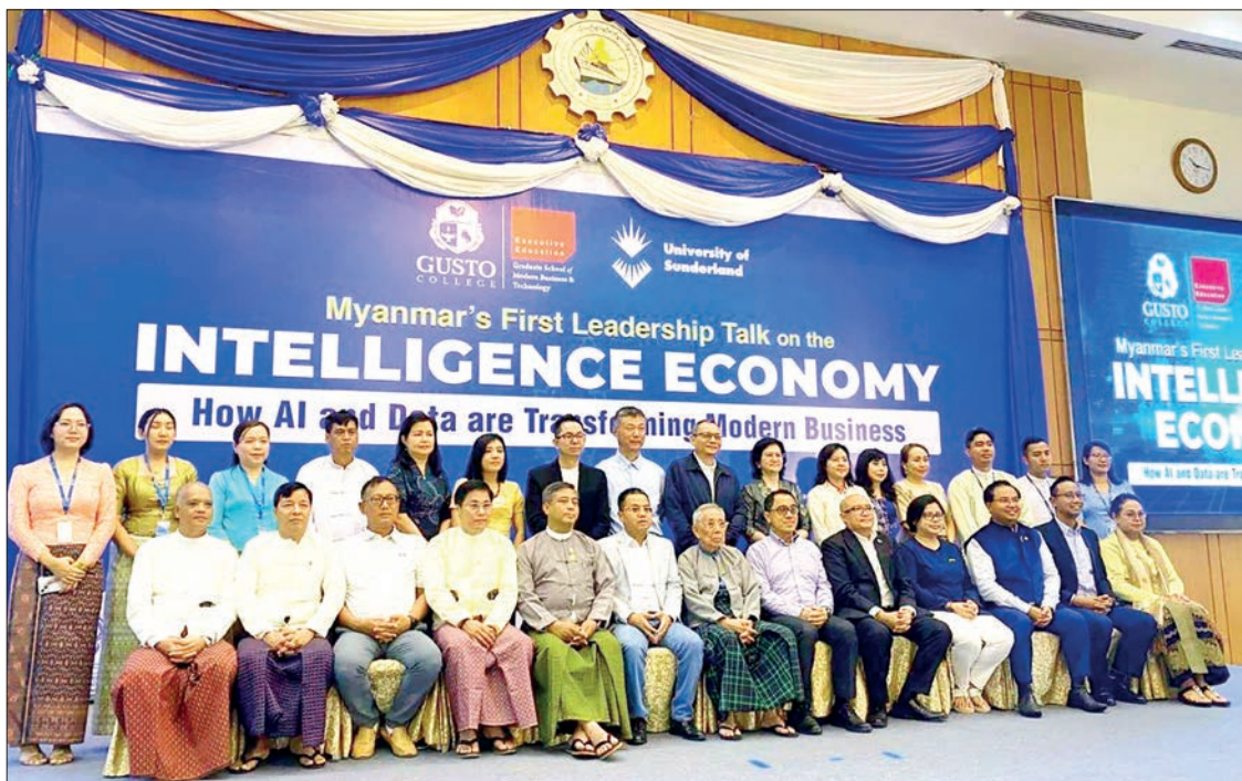
A documentary group photo session of the attendees at The Talk on the Intelligence Economy.