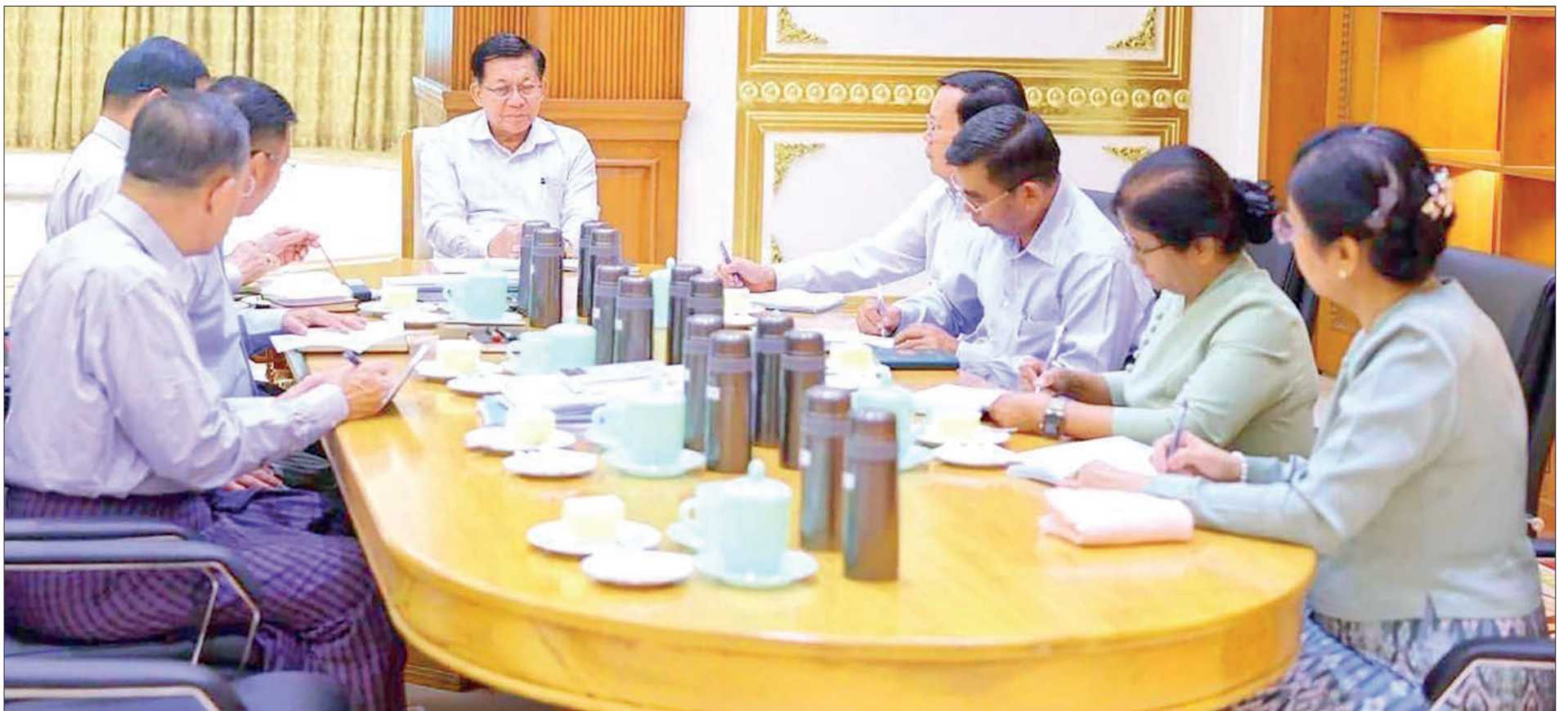
Acting President and State Security and Peace Commission Chairman Senior General Min Aung Hlaing chairs the meeting to ensure fuel security, affordable fertilizers, the use of natural over chemical inputs, and the adoption of solar-powered farming systems.

To reduce heavy foreign currency expenditure on imported edible oil, it is necessary to expand the cultivation of oilseed crops such as sunflower, soybean, and sesame, improve sunflower production, ensure affordable access to fertilizers, and provide maximum State support while encouraging farmers to maximize yields.