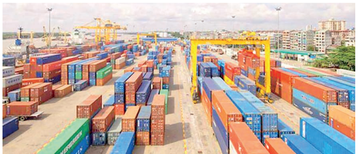
A bird's-eye view of a container yard with containers from shipping lines at Yangon Port along the Yangon River.

which is the largest ship that AWPT Port has handled. — NN/KK