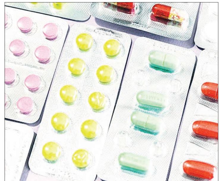
It is this dual dysfunction that GLP-1 drugs are designed to address.

The body's cells become resistant to insulin, or the pancreas does not produce enough of it, or both - while glucagon continues to drive blood sugar higher. It is this dual dysfunction that GLP-1 drugs are designed to address, the release stated. — ANI