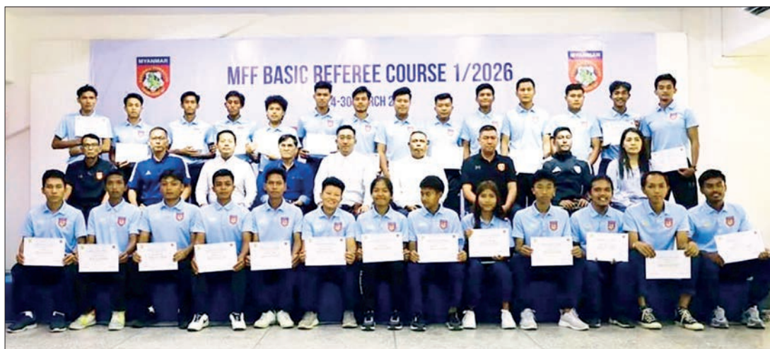
The closing ceremony of the MFF Basic Referee Course 1/2026.

MFF further stated that top-performing referees from this batch will be assigned officiating duties in age-group competitions and domestic tournaments organized by the federation. This initiative aims to provide them with the necessary experience to elevate their skills to a professional level. — MT/ZN